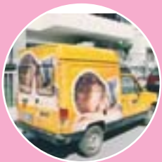
Creative applications with Sirocco 1080